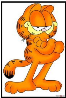
Garfield Gg, FF, Ss, Bb